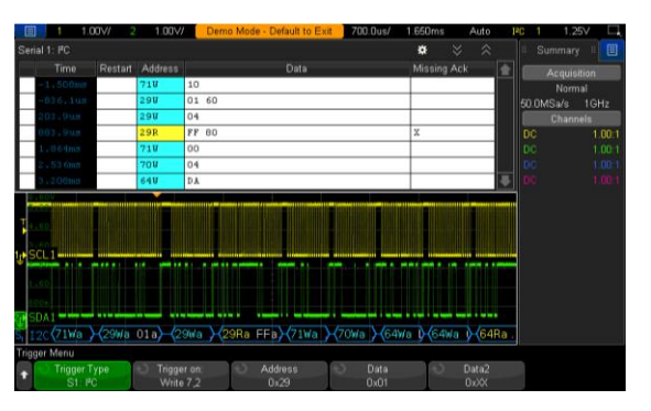
Embedded serial bus analysis (standard)

Frequency response analysis - Bode plots (standard)